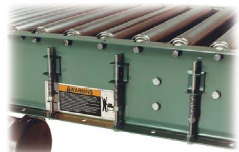
VARIABLE PRESSURE ADJUSTMENT