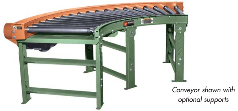
Model 297CDLRC features structural steel channel frames for conveying heavy unit loads. Heavy castings, drums and numerous other loads not requiring product orientation may be transported on this heavy duty chain driven live roller curve.