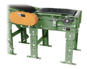
OPTIONAL CHAIN DRIVEN FEEDER