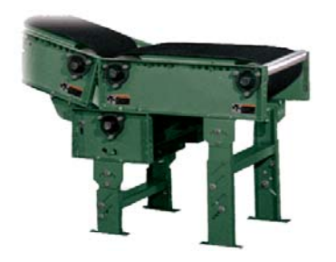
OPTIONAL INTEGRAL FEEDER